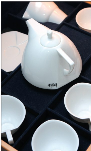
The Tai Chi Rose