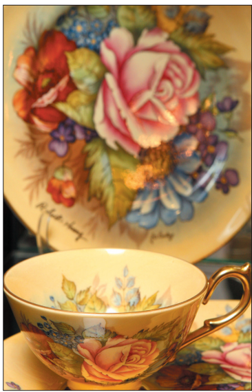
The Victoria Collection