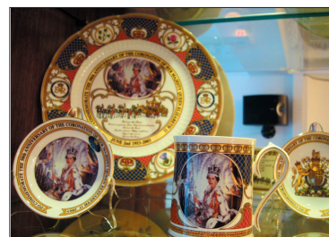
A set of special commissions Aynsley designed to commemorate the 50th anniversary of the coronation of Queen Elisabeth II in 2003.